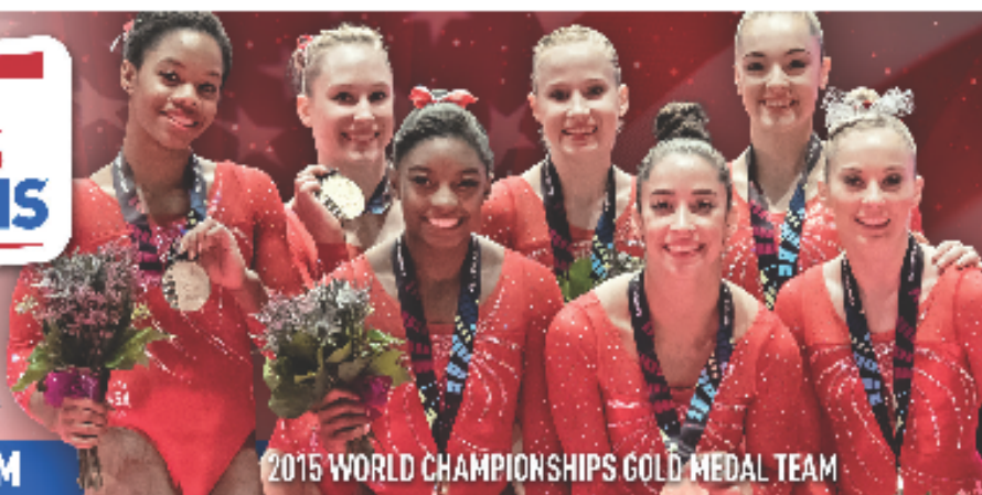
2015 WORLD CHAMPIONSHIPS GOLD MEDAL TEAM